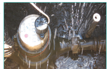
Call BWS for any problems with your water meter, such as meter leaks.

If there are any leaks on your property, the customer is responsible for paying for the pipe repair and water that was wasted through a leak.