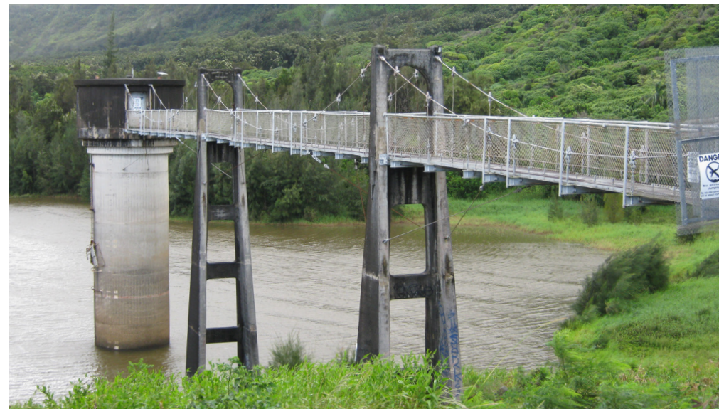
Nuuanu Reservoir No. 4 features a tower through which water drains from the reservoir pool.