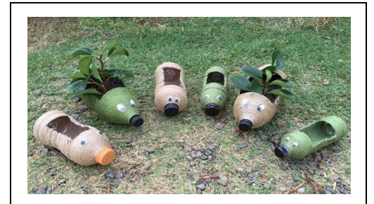
Luke and Cheryl Takayama made a whole family of "Xeric Critters after their workshop at Halawa Xeriscape

I want to feature the following members and thank them for sharing their 2015-2016 workshop skills put to test! Their success encourages the rest of us to do the same! Happy 2017!