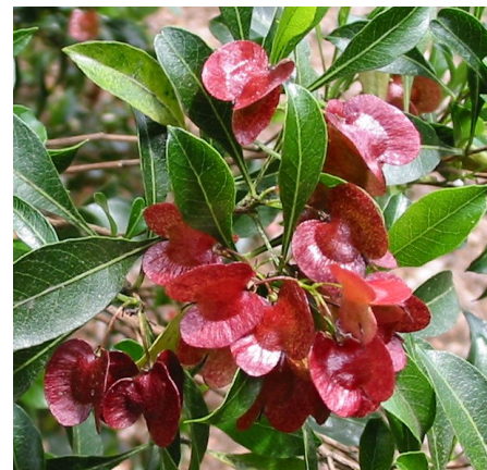
'A'ali'i Dodonaea viscosa