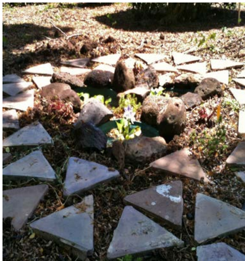
Pond just after being built

Since the pond's arrival we have seen mongoose and an increased number of birds, spiders and bees enjoying the area. We are still waiting for a frog or toad to move in and make its home, which would absolutely complete this mini environment!