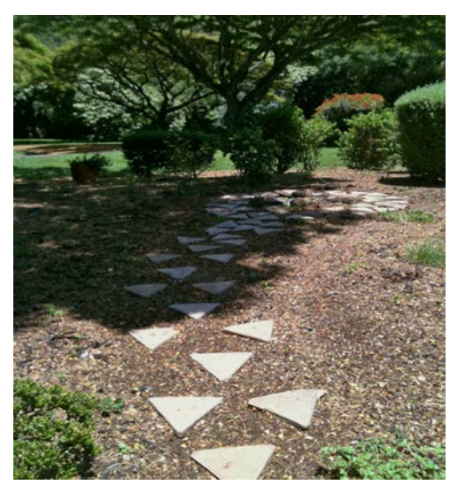
Pathway leading to pond