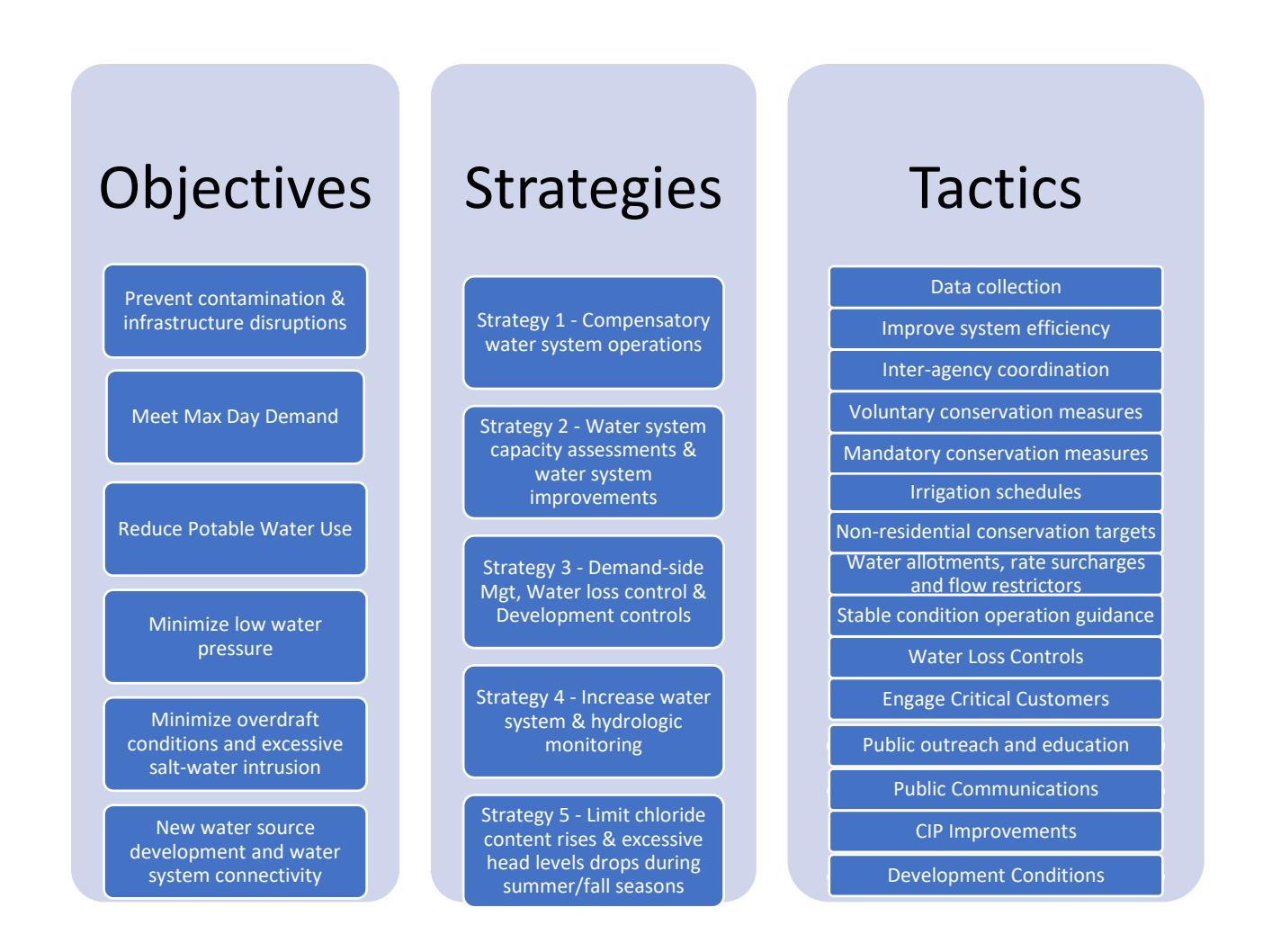
Figure 2: BWS Water Shortage Response and Recovery Objectives Strategies and Tactics